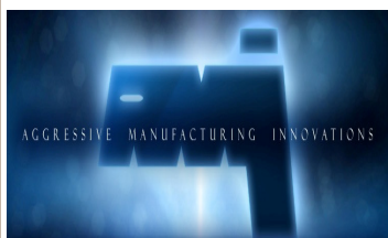
Aggressive Manufacturing Innovations, Inc.

Welcome to our NEW quarterly newsletter! We realize it has been a while since you saw a newsletter from our office. . . . so in an effort to continue to keep everyone apprised of all the great projects we are working on and the developments throughout our County, we will begin providing quarterly newsletters . . . so watch for continued information updates!